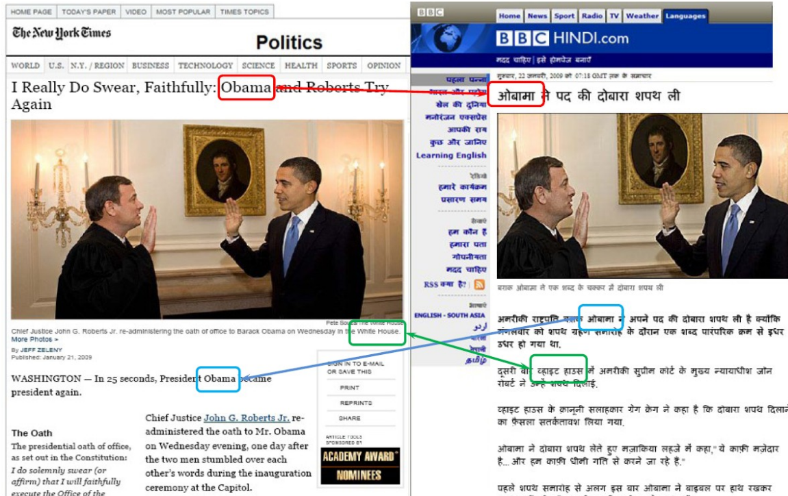
Figure 1. Comparable Corpora

We discuss the motivation behind our approach in Section 2 and present the details in Section 3. In Section 4, we describe the evaluation process and in Section 5, we present the results and analysis. We discuss related work in Section 6.