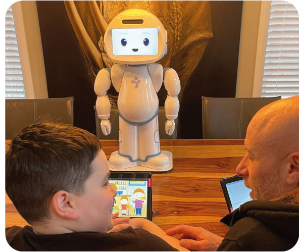
Figure 1: The triadic setup in interactions with QTrobot for Autism: Child, parent and robot.

During each session, parents use the Educator tablet to select the activities identified through the parent quiz. The robot then leads the activity, providing instructions, age-appropriate questions, and visual stimuli to support learning. For receptive language skills, the robot presents stimuli on the