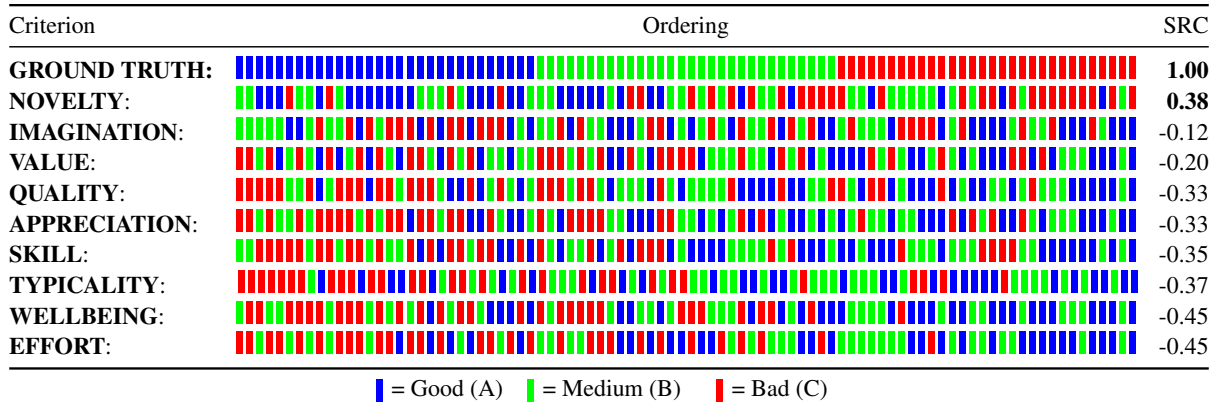
Figure 1: The poem orderings obtained in evaluations by human non-expert judges, using data from Lamb et al. (2015). Each poem is colour-coded by its ground truth category, and for each criterion, poems are ranked from highest-rated (left) to lowest-rated (right). The figure highlights a significant inversion of the ground truth for most criteria; for example, the predominance of red-coded (“Bad”) poems at the top (i.e. on the left-hand-side) of the “Typicality” ranking demonstrates that judges rated the lowest-quality poems most highly.

= A, “Medium” = B, and “Bad” = C. Each category comprises 30 poems, resulting in the ground truth order: [A ... (30 times), B ... (30 times), C ... (30 times)]. In rank correlation used to analyze our results, A corresponds to rank 1, B to rank 2, and C to rank 3 (see Figures 1 and 2, and Figure 3 in the Appendix A.5).