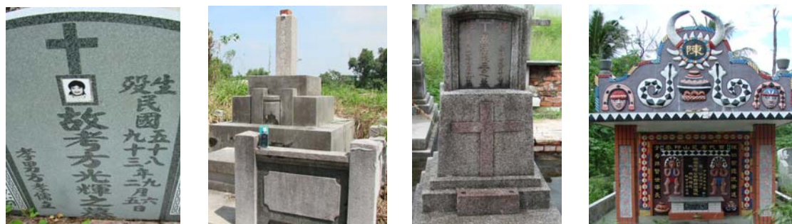
Plate 1 to 4: From left to right, a sinicized aborigine tomb, a Japanese-style Han tomb, a christianized Han tomb and a de-sinicized aborigine tomb.

Tombstone inscriptions represent a linguistic genre which, due to the moment it represents, allows for profound insights in culture and language. When the trivia of life don't matter anymore and the cullets of life are swept together in a few strokes in marble, language is frequently the only agent and the only trace in a battle between conflicting identities, social relations, conceptual systems, mythologies and religions.