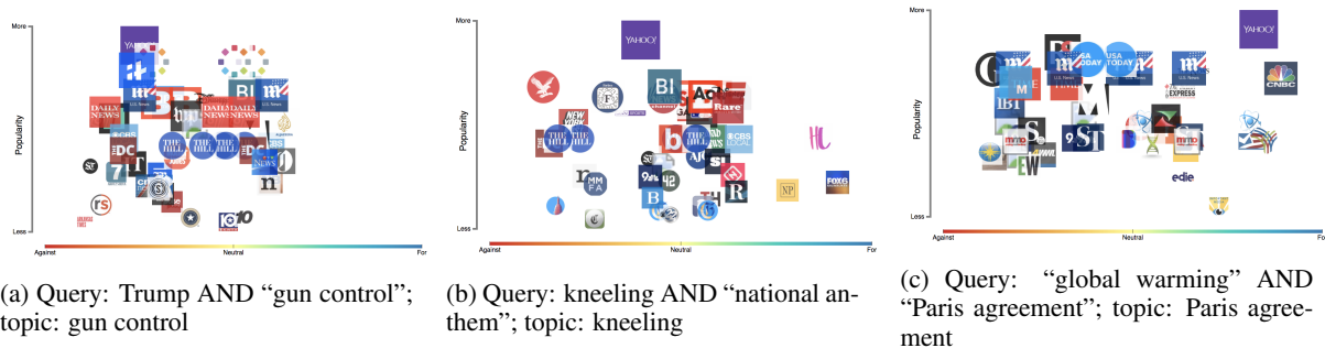
Figure 3: 360° Stance Detection visualizations for example queries and topics.