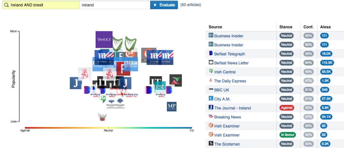
Figure 2: 360° Stance Detection interface. News articles about a query, i.e. ‘Ireland AND brexit’ are visualized based on their stance towards a specified topic, i.e. ‘ireland’ and the prominence of the source. Additional information is provided in a table on the right, which allows to skim article excerpts or follow a link to the source.

In order to evaluate a series of articles, enter a keyword to fetch the results from AYLIEN News API and another keyword to fetch the results from Stance Detection model. Please note that these two keywords could be different.