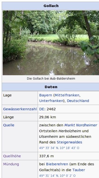
Figure 1: Infobox of the German Wikipedia article about Gollach .

similar to York vs. New York ). We have to use a longest match strategy to avoid such overlapping annotations.