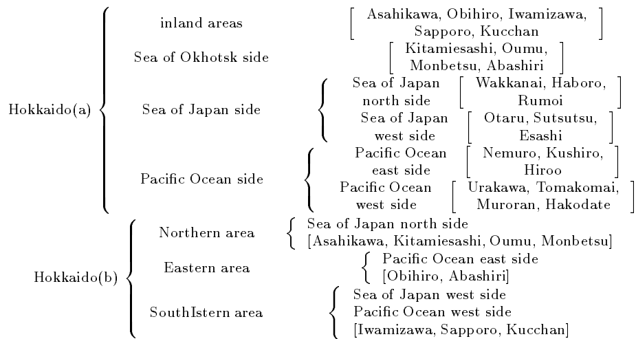
FIG. 2: The Ontologies with District Names for Weather Forecasts in Hokkaido