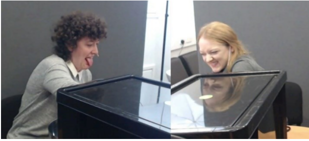
Figure 1: Participants during the poker chip task.

openings, such that the contents of the container remained invisible (see Figure 1). In the competitive setting, subjects were instructed to look for white chips. The person who found more chips within 2 minutes won the round. In the cooperative setting, participants worked as a team and had to find 10 red and 10 blue chips, also within 2 minutes. In both conditions, participants had to inform each other when they found any chips. They were also instructed to put every non-target chip (i.e., red or blue in the competitive condition, white in the cooperative condition) back in the box.