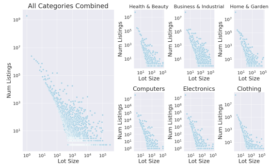
Figure 2: Distribution of lot size across categories. The distribution displays a classic power-law behavior across all categories (note the log scale in the axes.)