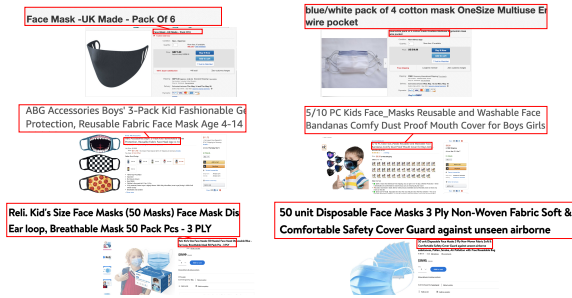
Figure 1: A comparison of lot offerings for protective masks across 3 e-commerce sites: ebay.com , amazon.com , and walmart.com . The price per unit varies across these offerings from $0.40 to $5.00.

This work is motivated to automatically detect lot offerings, but a critical reader may ask, why not ask the sellers to explicitly designate their lot offerings (and provide an explicit lot size)? In fact, such an option does exist on many e-commerce platforms. eBay 3 , for example, has a standalone interface for sellers to input lot entries. Unfortunately, the adoption of this feature among the seller population is quite low. While sellers often have an incentive to clearly designate their offering as a lot, in practice interfaces to specify structured lot metadata are difficult to navigate. These interfaces are often unfamiliar to sellers and not standardized across marketplaces. This issue becomes more acute when sellers upload their offerings in (often large) batches, using a non-visual interface, to multiple marketplaces.