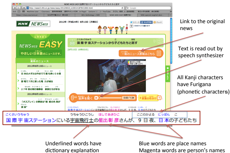
Figure 1: Screen shot of News Web Easy

News Web Easy resolves this issue by providing glossaries to explain difficult terminology. On the News Web Easy site, a glossary entry can be accessed by simply positioning the cursor over a word. A pop-up explaining the term is then displayed. A dictionary for Japanese elementary school students was used to provide the glossary entries.