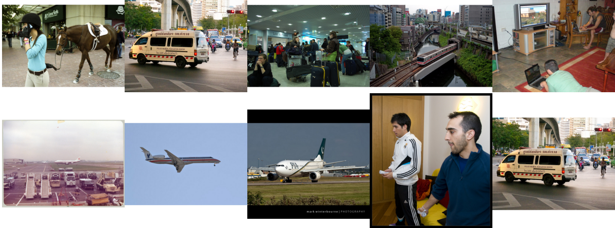
Figure 3: Top 5 results of the object only baseline (top row) and our classifier-based parser (bottom row) for the query “The white plane has one blue stripe and one red stripe”. The object only system seems to be mainly concerned with finding images that contain two stripe objects at the expense of finding an actual plane. Our classifier-based parser also outputs the relation between the stripes and the plane and the colors of the stripes which helps the image retrieval system to return the correct results.