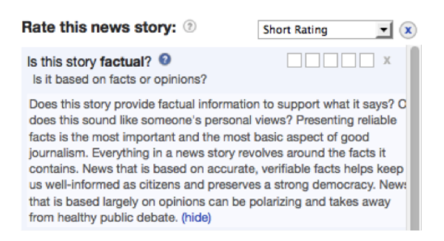
Figure 2: Mousing over the question makes the text "Is it based on facts or opinions?" appear in pale grey text. Clicking on the question mark icon next to the question, "Is this story factual?" reveals an explanation of what the user should be rating.