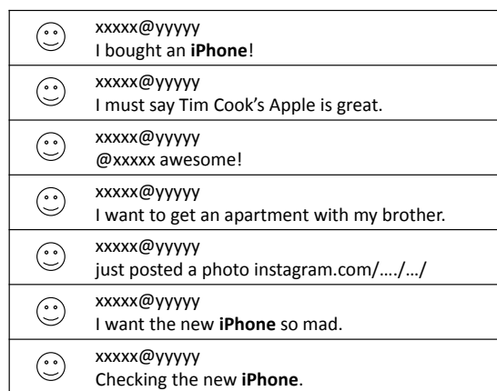
Figure 1: Timeline of tweets by a Twitter user who bought an iPhone. (most recent tweet on top)

In research about customer purchasing, there are some studies about recommender systems. A popular approach used by recommendation systems is collaborative filtering for identifying users similar to a target user based on their purchase history, and then recommending products that similar users have already bought but the target user has not (Schafer et al., 1999; Sarwar et al., 2000). However, in this approach, it is required that a target user has bought something before. Furthermore, it is difficult to recommend