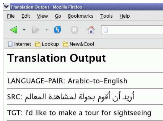
Figure 3: Example of an Arabic sentence translated into English.