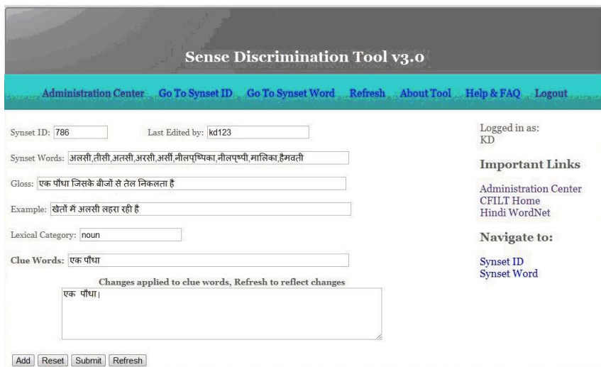
Figure 2: Screen-shot showing the working of the system