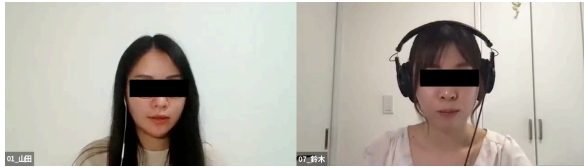
Figure 1: Photo of participants engaged in negotiation task