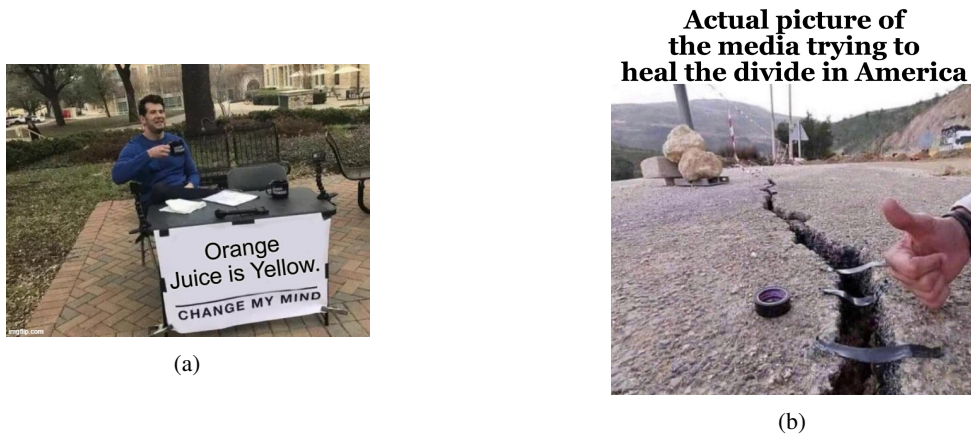
Figure 1: Examples of memes where the analysis of only the text (a) or both the text and image (b) are required to automatically detect the correct persuasion technique.

around identifying 22 rhetorical and psychological disinformation techniques in internet memes. These techniques cover a wide array of phenomena like Causal Oversimplification , Exaggeration/Minimisation , Name Calling/labeling or Presenting irrelevant data (red herring) . For a full list of all categories, we refer to the task description paper (Dimitrov et al., 2021).