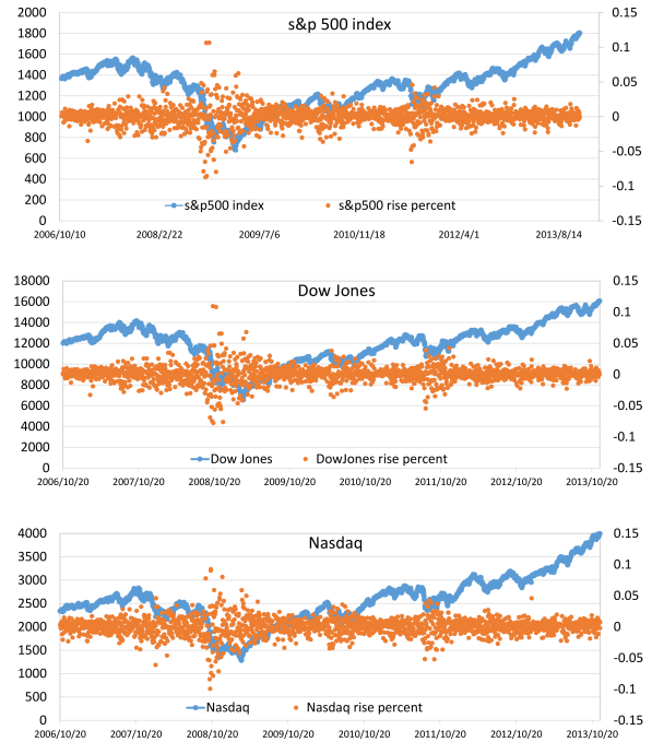
Figure 3: S&P 500, Dow Jones, and Nasdaq indices (open prices) and their daily returns during the experiment period of from 2006/10/20 to 2013/11/27.