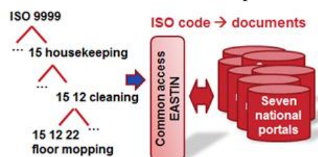
Fig. 1: Searching in national portals using ISO codes

In 2005 the major European AT information providers joined in the European Assistive Technology Information Network (EASTIN). EASTIN provides a portal ( www.eastin.eu ) where people can access all databases of its national members simultaneously; the central server collects information on all products existing in one of the databases of the associated partners, so information seekers search on European level.