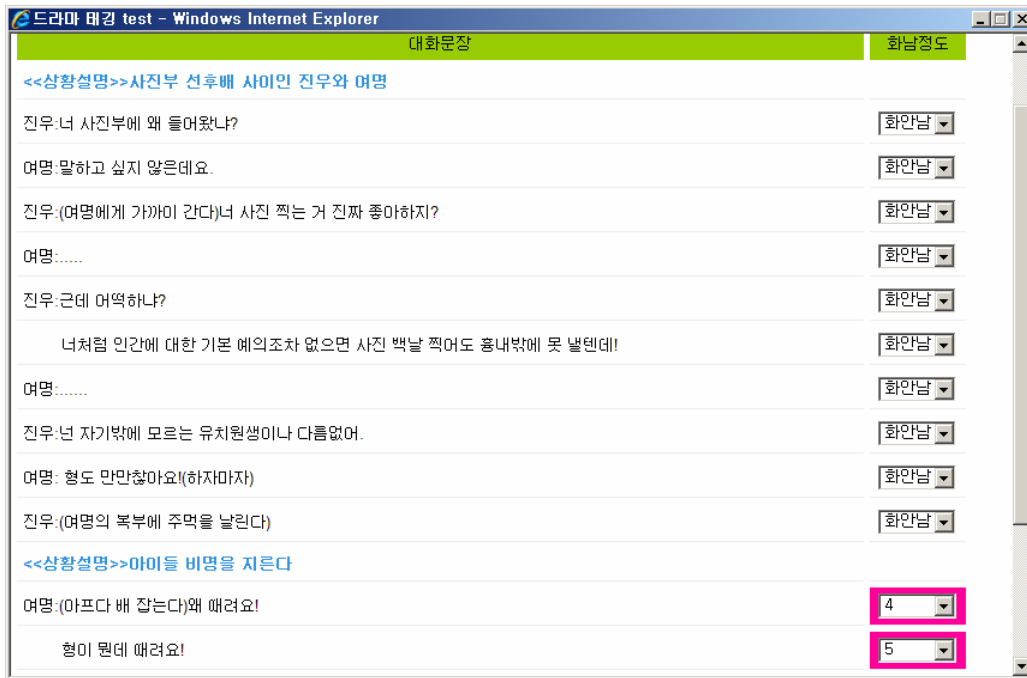
Figure 3: The screen shot of the test page (in Korean)

We performed an independent T-test ( p < 0.05 , two-tailed). The total number of the interrogative sentences we used for the test was 29; the mean values of IS and CS were 3.81 and 2.89, respectively; and their standard deviations were 1.60 and 1.536, respectively. The result was found to be statistically significant at the 0.05 level ( df: 508, p < 0.05 ). Table 2 shows part of the sentences that are statistically significant.