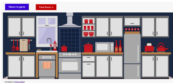
Figure 2: Screenshot of secondary task “Kitchen” screen