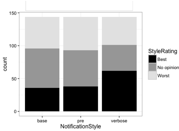
Figure 3: Preferences by Notification Style