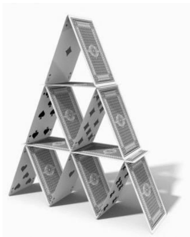
Figure 2: A pyramid built out of playing-cards.