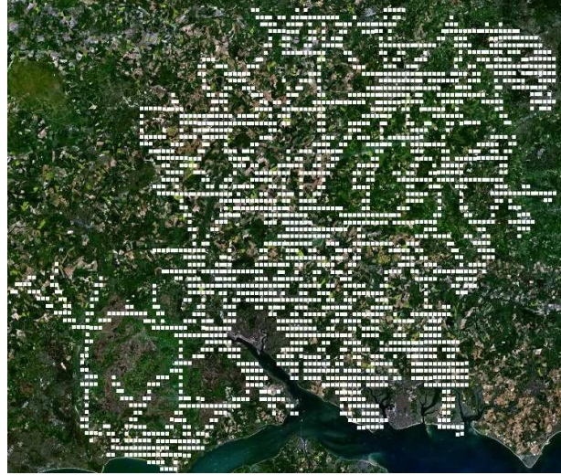
Figure 2: Road Ice Model Data Points Map

trivial due to the complexity and size of the input data.