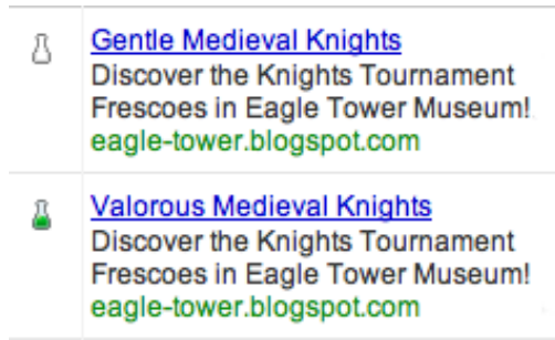
Figure 2: Ads used in the second experiment