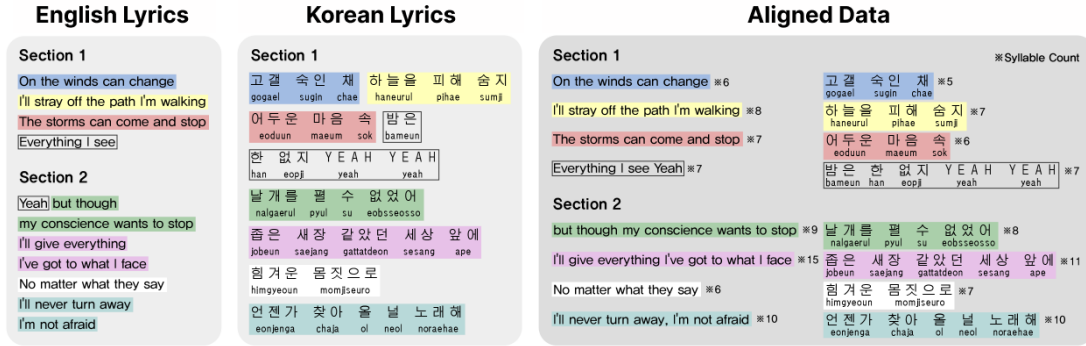
Figure 2: An example of the alignment task, using “Beautiful” by Amber, along with its English and Korean lyrics and their alignments with syllable counts in each language. We obtained the syllable counts by employing the syllables library for English. For Korean, we simply counted the number of characters, as each character in Korean corresponds to one syllable.

into the construction methodology and details of the dataset. Moving further, we will uncover the unique characteristics of K-pop translation that differentiate it from previously extensively analyzed genres, and demonstrate the application of our dataset to the neural lyric translation task, revealing the necessity of singable lyrics dataset for the enhancement of model performance. We will conclude the paper by highlighting the insights acquired through our experiments using our dataset.