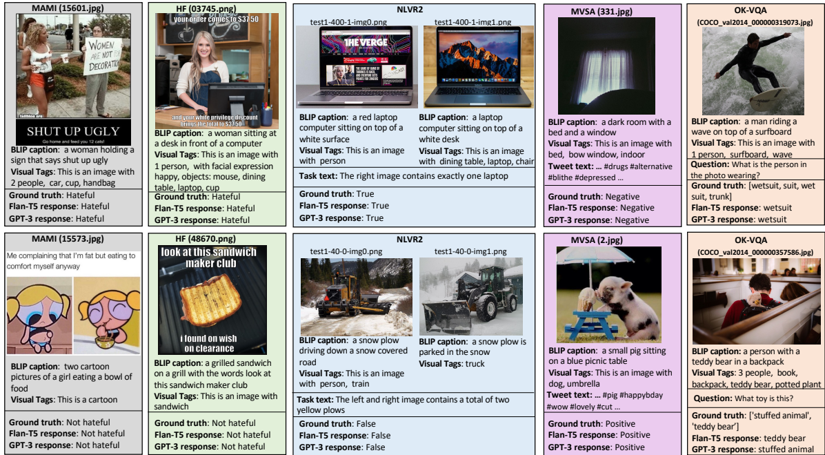
Figure 2: Qualitative examples for each evaluated dataset. The samples include the ground truth and responses generated via prompting Flan-T5 and GPT-3 models. Samples for the MAMI and HF datasets are prompted including the overlay text embedded in an image, which is excluded in the graphic for spacing reasons.

tions of multiple image classification predictions) to show the the comparison against captions generated by the BLIP model.