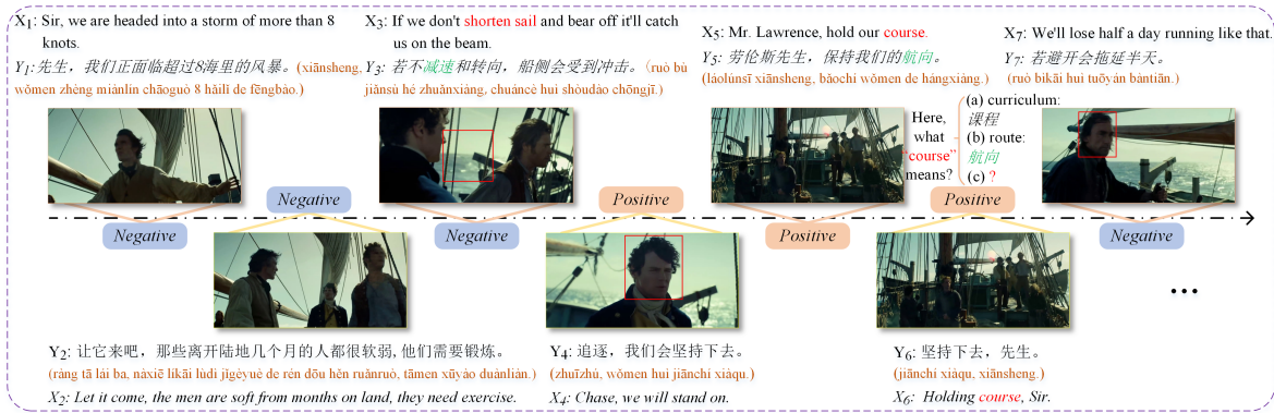
(a) The current location "on the sea" helps disambiguate polysemy ("course" in X 5 ).