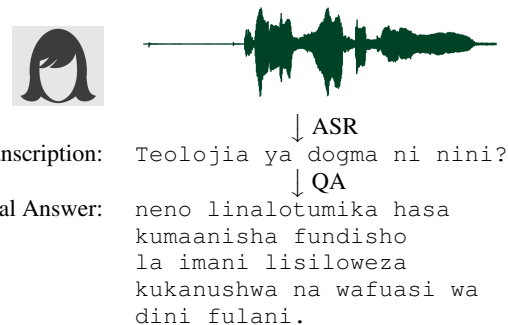
Figure 1: Illustration of the envisioned scenario for a user-facing QA system that SD-QA aims to evaluate (example from Kiswahili).

is substantial room for improvement. Existing QA system evaluation benchmarks rely on text-based benchmark data that is provided in written format without error or noise. However, inputs to real-world QA systems are gathered from users through error-prone interfaces such as keyboards, speech recognition systems that convert verbal queries to text, and machine-translation systems. Evaluating production-ready QA systems on data that is not representative of real-world inputs is problematic and has consequences on the utility of such systems. For example, Ravichander et al. (2021) quantify and illustrate the effects of interface noise on English QA systems.