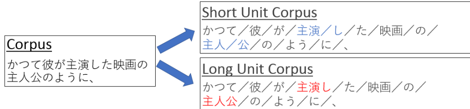
Figure 1: Short and long unit corpora