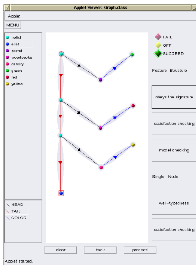
Figure 2: Graphically evaluating constraint satisfaction of feature structures.

from the elist node. The query, asked in a separate window, is whether the feature structure satisfies the constraint ( nelist , head:(parrot, color:green), tail:nelist). Since this is the case, the green light on the function console to the right is signaling succeed . If we were to perform model checking of the same feature structure against the same constraint, checking would fail, and MoMo would indicate the nodes of the feature structure that do not satisfy the given constraint.