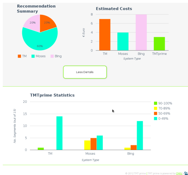
Figure 3: Results shown by TMTprime system

bar-graph gives an estimated cost of using a single translation system alone and the estimated cost when using TMTprime’s combined recommendation. The estimated cost using TMTprime is lower when compared to using a single MT or TM system alone (in the worst case, it will be the same as the best-performing single translation engine or TM system). This estimated cost includes both the cost for translation (currently uniform cost for each translation system) and the cost required for post-editing. For example, if the MT is an in-house system the cost of translation will be (close to) zero whereas there is potentially an additional base cost for using an external MT engine. Finally, the interface provides statistics related to various confidence levels for different translation outputs across the various translation and TM systems.