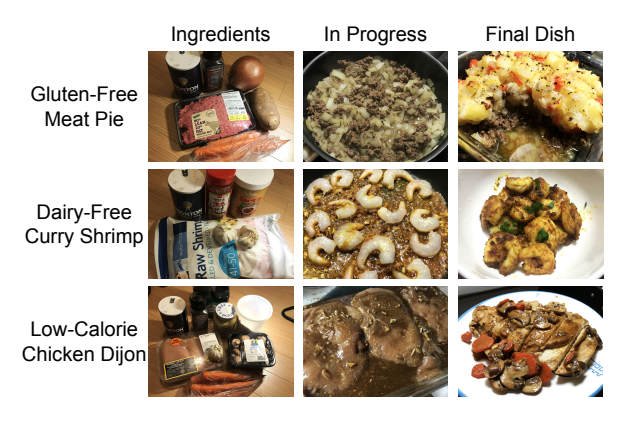
Figure 3: Cooked dishes following our model-edited recipes.

this recipe use ingredients that violate the dietary constraint?" and further asked to provide free-form textual feedback if any.