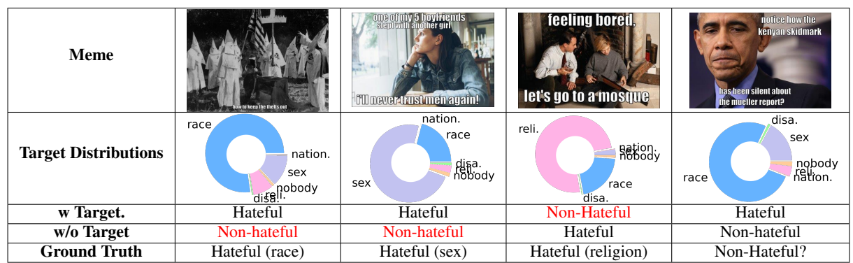
Table 9: Example predictions of PromptHate with and without target information. Incorrect prediction in red. Ground truth for the right-most meme is questionable.