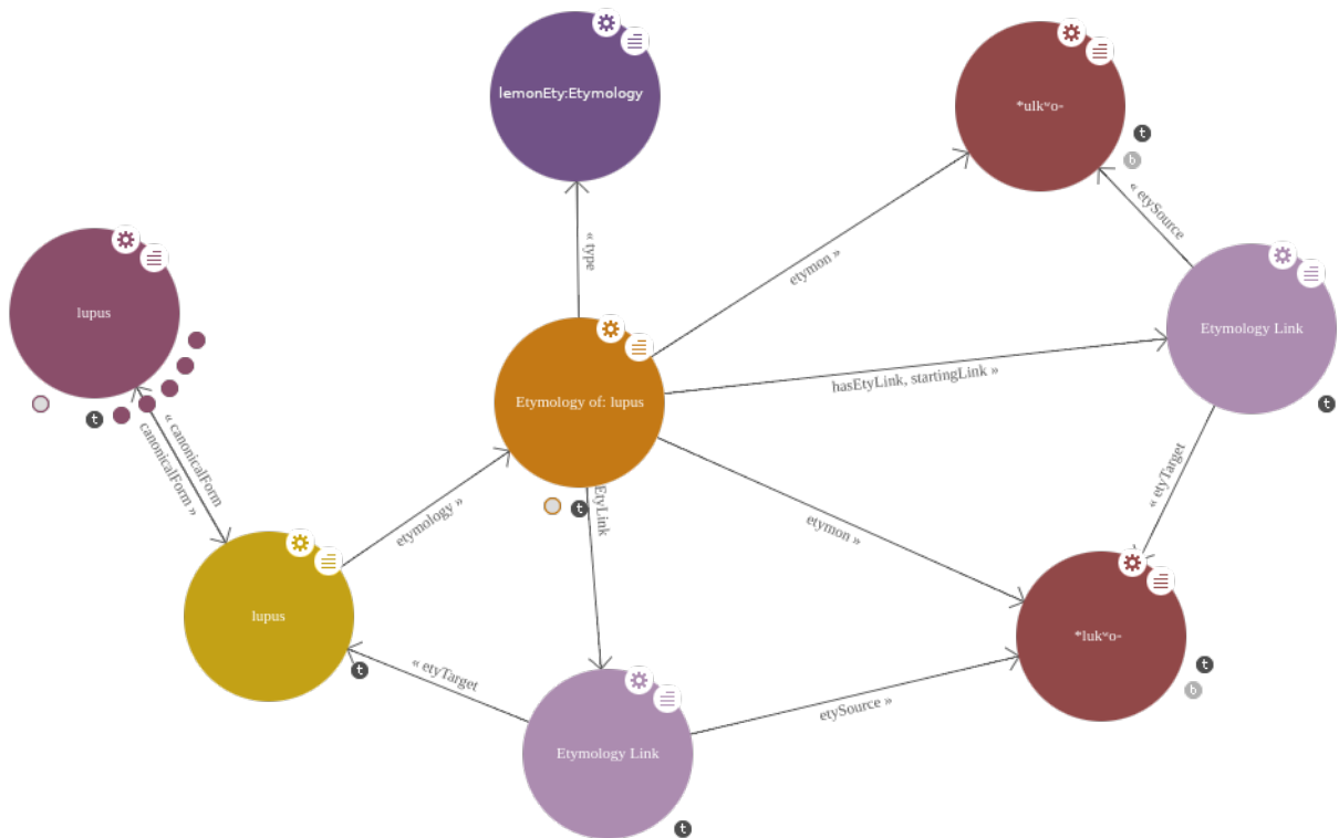
Figure 1: The etymology of lupus in LiLa according to the lemonEty model.