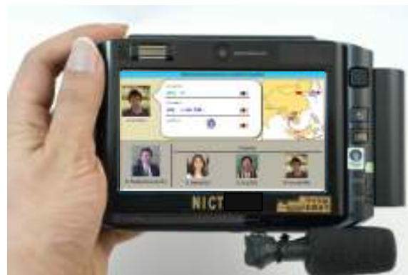
Fig. 2. The client application on a hand-held terminal device.

The client applications are implemented on a handheld mobile terminal device (Sony VAIO-U) shown in Fig. 4, which allows portable speech-to-speech translation. The device is 150-mm wide, 95-mm high, and 32-mm thick.