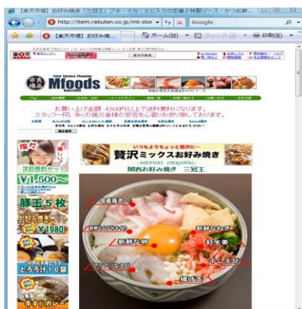
Figure 2. An example of a web page for a travel product