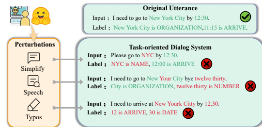
Figure 1: The impact of diverse input perturbations on the slot filling system in real scenarios.

When faced with the uncertainty and diversity of human language expression (Wu et al., 2021), these perturbations significantly impact the SF model’s generalization ability, thereby hindering its application in practical dialogue scenarios.