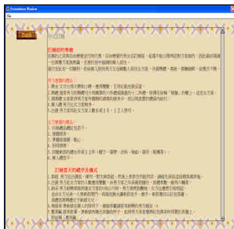
Figure 4. The narration of multimedia learning material