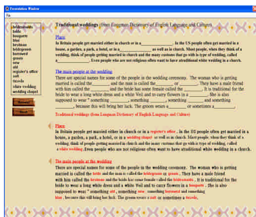
Figure 3. Portal for supplementary CALL material - "wedding"

With regard to writing assignment, the researchers designed a series of activities as prelude to the process analyzing writing. This was done due to the fact that students always complained about not knowing what to write. These activities offered students some vocabulary words and ideas for their writing assignment. In this case, they needed to write some procedures of traditional Chinese or Taiwanese wedding. One of the activities was done as an information gap activity. Students read some gapped texts related to the traditional western wedding and listen to the recorded voice to read the complete version of the text. Then they have to fill in the gaps by selecting words from the word bank offered on the computer screen. In this way, they may learn some vocabulary words related to wedding (see Figure 3). The text was adopted from the Cultural dictionary, and has been revised. They also can try to find some websites to provide them information about Chinese or Taiwanese wedding traditions (Figure 4). Moreover, they could click the viewing buttons to view some video clips of a Taiwanese wedding (Figure 5). When the student learned several marriage related vocabulary and customs, they were required to write the essay. The material here is intended to promote students' interest in the wedding procedure, and motivate their intentions in using rich and various terminologies in their writing.