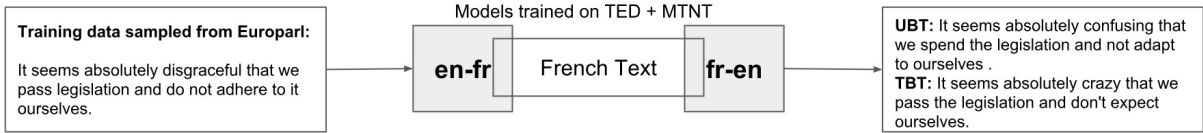
Figure 1: Pipeline for injecting noise through back translation. For demonstration purposes we show the process in an English sentence but in experiments, we use French sentences as input.

select an emoticon and insert it on both sides. Algorithm 1 elaborates on this procedure.