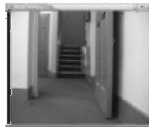
Fig.2: Image Viewer

LAN interface. Godot's navigation system relies on sonars, infrared sensors and odometry, and not the bumpers or the camera. However, the camera is used as live feedback to the user (Fig. 2), who is able to look "through the eyes" of Godot while engaging in a dialogue.