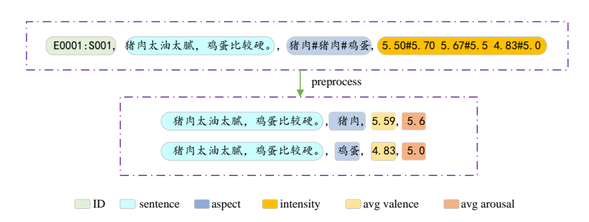
Figure 3: An example of data preprocessing.