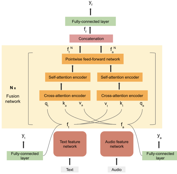
Figure 1: Our Model Structure