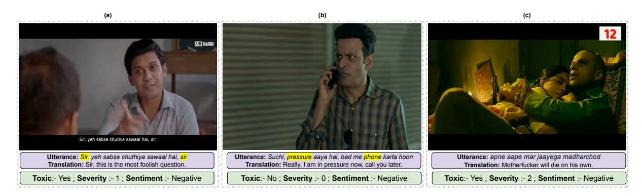
Figure 1: Some samples from annotated ToxCMM dataset; The yellow highlighted words are in English.

notators improved. To ensure consistency, we corrected errors from previous batches, and for final labels, majority voting was employed. In cases of disagreements among annotators, expert input was sought. Annotators were instructed to be unbiased in their assessments. The quality of annotations was assessed using Fleiss' Kappa scores (Fleiss, 1971), resulting in IAA scores of 0.74 for toxicity classification, 0.67 for sentiment classification, and 0.64 for severity detection, confirming dataset quality and reliability. Figure 1 shows some samples from annotated ToxCMM dataset. Sample (b) shows a non-toxic video with negative sentiment. In contrast, both samples (a) and (c) are identified as toxic videos with negative sentiments. However, sample (a) is deemed less severe, while sample (c) is considered more severe due to its explicit use of profanity, aggressive language, and the wish for harm or death upon someone.