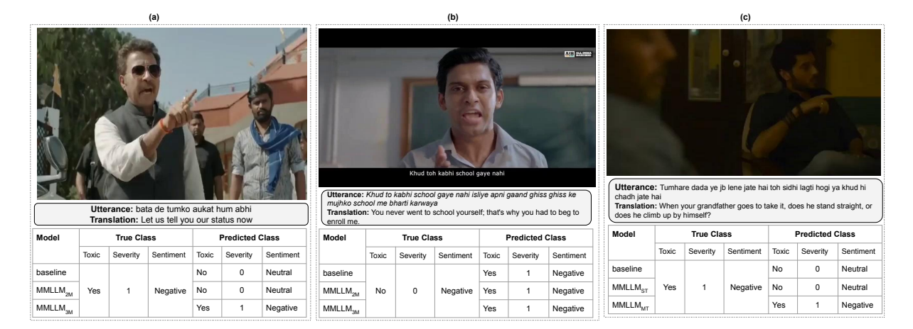
Figure 4: Human annotation Vs. model's prediction for qualitative analysis with different settings