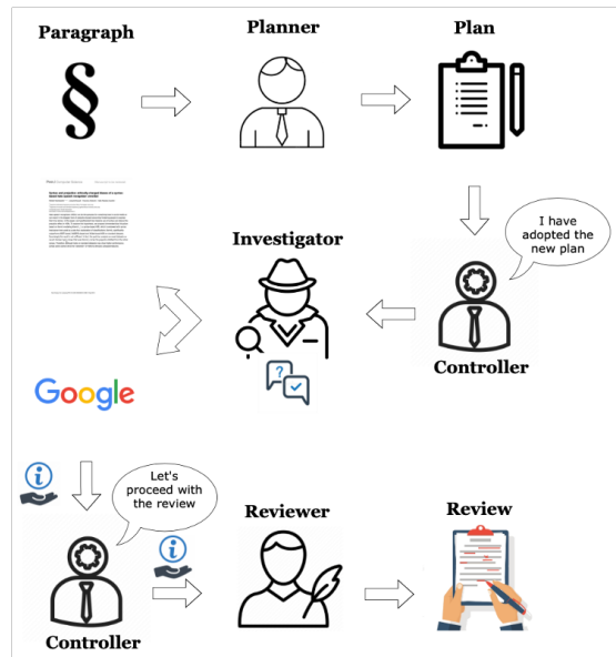
Figure 2: Illustration of our approach.

of reviews and exclude review sentences that do not constitute focused feedback during dataset compilation (Section 5.1). Specifically, we focus on the following five aspects 3 : Replicability , Originality , Empirical and Theoretical Soundness , Meaningful Comparison , and Substance . We exclude remaining aspects because they focus on refining the surface form ( Readability and Clarity ), are inherently subjective ( Impact , Motivation ) or do not constitute feedback ( Summary , Appropriateness ).