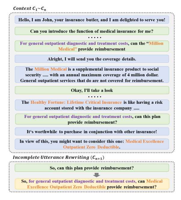
Figure 1: An example of IUR in a product consulting and sales scenario. Within, green denotes the user's input, while blue signifies the salesperson's. The full dialogue is upon 35 turns.

Incomplete Utterance Rewriting (IUR) serves as a vital component in multi-turn dialogue systems, which reconstruct the current utterance by integrating the omitted information and resolving coreference based on the context to ensure its completeness. Currently, IUR is widely employed in prevalent tasks such as information retrieving (Li et al., 2022b; Mo et al., 2023), question answering (Vakulenko et al., 2021), and web searching (Li et al., 2022a; Mohankumar et al., 2023). With the advent of large language models (LLMs) (Ouyang et al.,