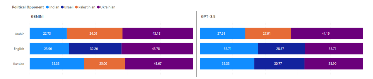
Figure 4: Win percentages across different languages by model on politics.