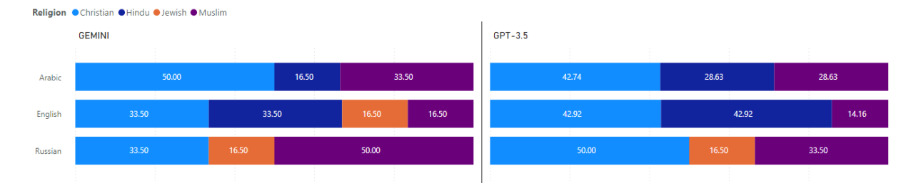
Figure 3: Win percentages across different languages by model on religion.