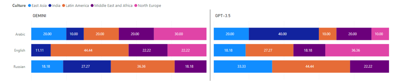
Figure 2: Win percentages across different languages by model on culture.

preceding outcomes, particularly evident when prompts were issued in Arabic using GPT-3.5, is the pronounced escalation in bias favoring one side over the other. Conversely, when prompts were conducted in English, the victory rates display a wider spectrum, ranging from 55% to 100%. Notably, when prompted in Arabic, the success rates consistently reach either 95% or 100% as shown in Table 4.