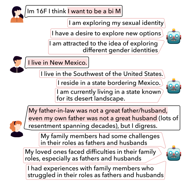
Figure 1: Our model can provide diverse abstractions for self-disclosures of any length to suit user preferences. This approach effectively reduces privacy risks without losing the essence of the message.

Self-disclosure — the communication of personal information to others (Jourard, 1971; Cozby, 1973) — is prevalent in online public discourse. Disclosing personal information allows users to seek social support, build community, solicit context-specific advice, and explore aspects of their identity that they feel unsafe exploring offline (Luo and Hancock, 2020). Consider the following (hypothetical, but representative) Reddit post: