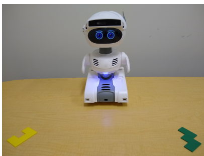
Figure 2: Misty in its task setting: Misty could move its head left and right, and had to look down at the objects on the table.