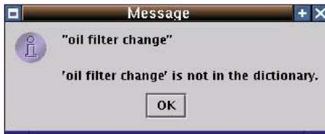
Figure 3: Diagnostic message when NP is not in the dictionary