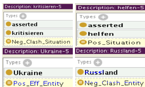
Figure 3: Sentiment Inferences

The verb “to criticize” is a a1a4_neg_effect verb, the direct object as well as the subclause inherit a negative effect. For our example (“Russia has criticized Europe for the fact that it helps the Ukraine”) we get (see Fig. 3): “helfen-5” is a positive situation 3 , thus, a polarity clash occurs (“criticize something positive”).